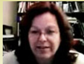
Video Answers in Survey

Click here to see a sample Qual e Video deliverable. (Streaming Windows Media)